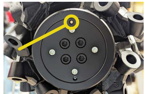
Breather plug. Grease may come through

3. Rotate the drums 90° and repeat 3 times until the entire drum is properly greased