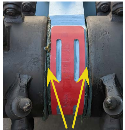
Proper greasing: coming out between the drum and housing